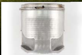
Virtually No Wear/Deposits