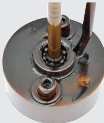
LEADING CONVENTIONAL HYDRAULIC FLUID (ISO 46)