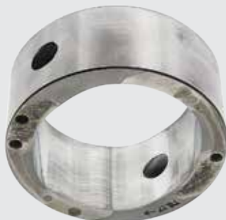
VANE PUMP CAM RING

Order by Phone 1-800-956-5695 - Give Operator Reference #5650390