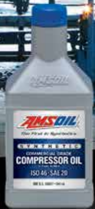
SYNTHETIC COMPRESSOR OIL