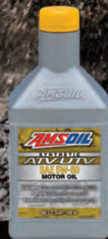
SYNTHETIC MOTOR OIL