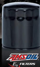
AMSOIL E3 FILTERS